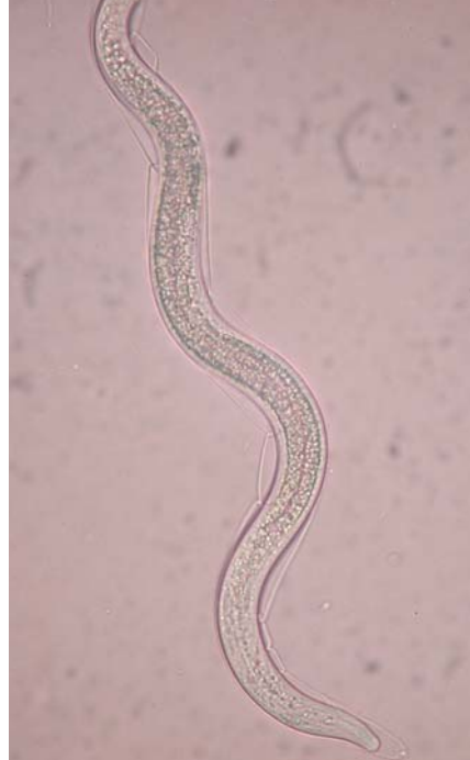
A closeup of a nematode.

Under ideal conditions (cool, well-mixed and aerated), nematodes in a spray tank should be able to survive for a few hours. But because no one except the grower has control over these conditions, the recommendations are to apply them as soon as possible. It should also be noted that any screens (50 mesh or finer) in the spray lines should be removed so that the nema-