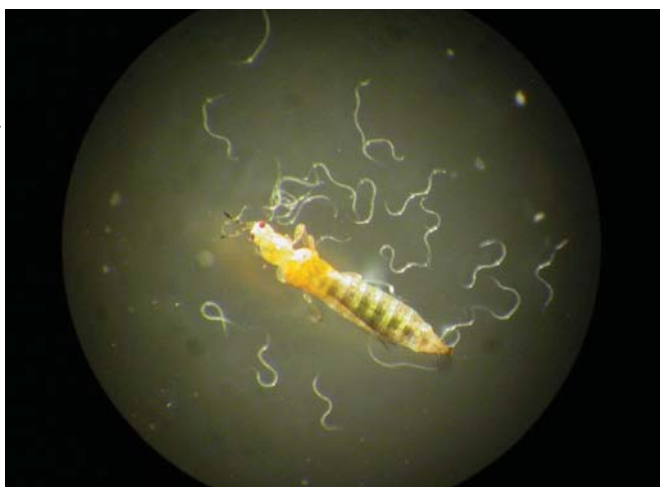
Thrips with nematodes.